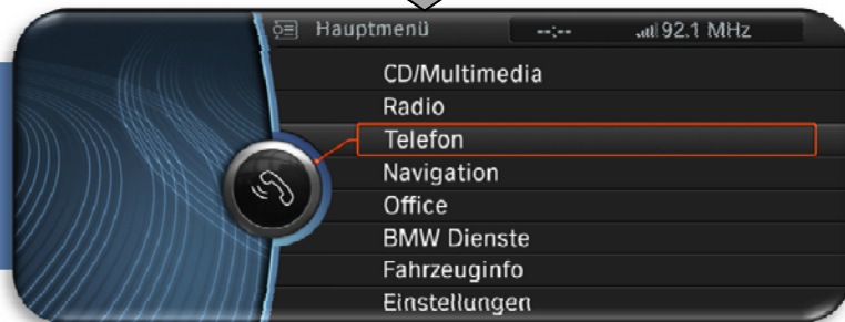
Car Information Computer CIC - 2008