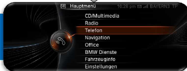
Next Big Thing CIC-HIGH (NBT) - 2012